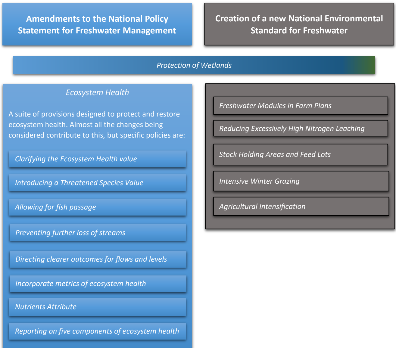
Figure 2: Essential freshwater policy areas by recommended instrument

Figure 2 shows what tool the analysis recommends for each policy area.