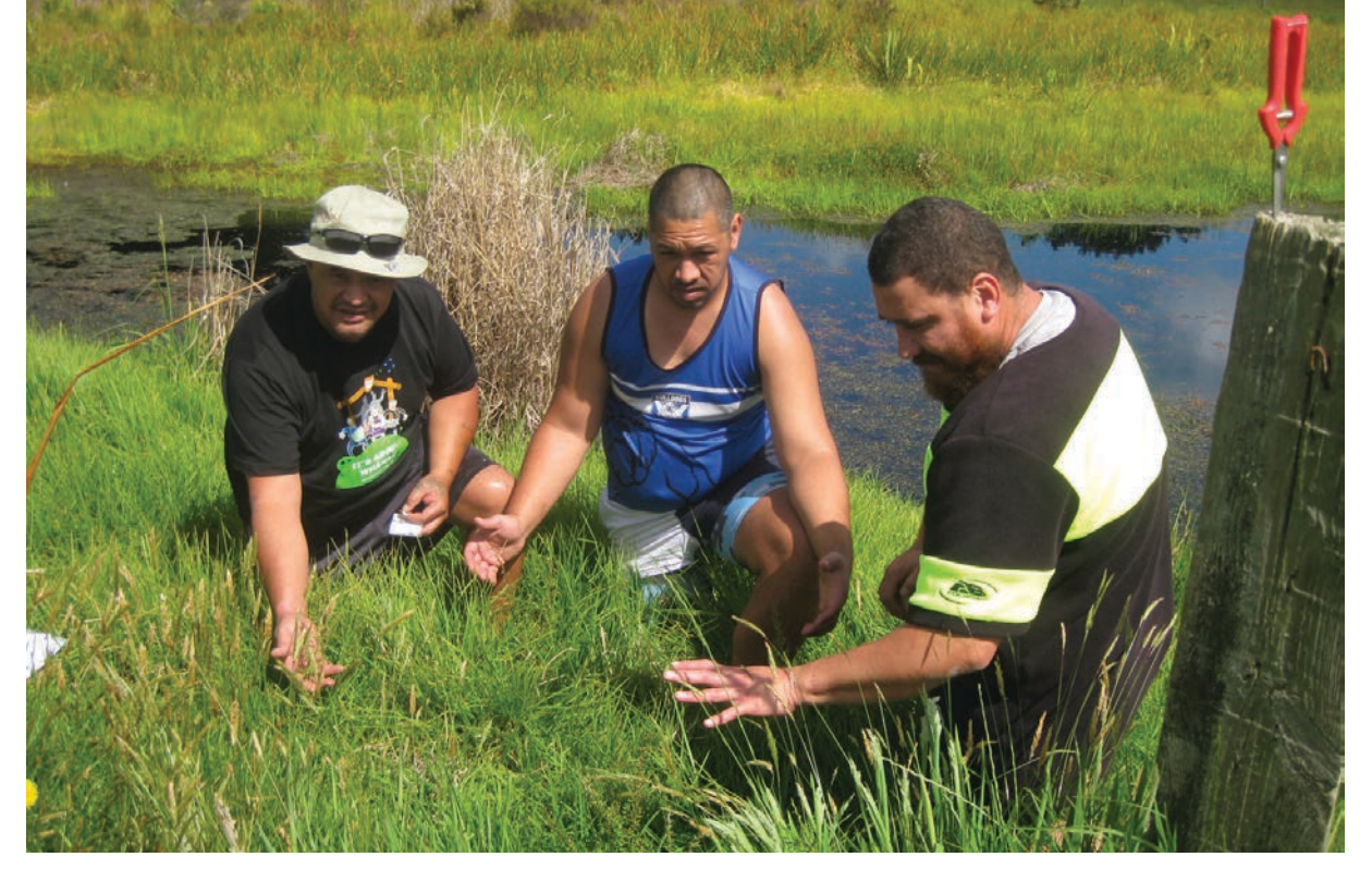
Te Hiku dune lakes project team releasing new manuka plantings at the Split Lake near Kaitaia.