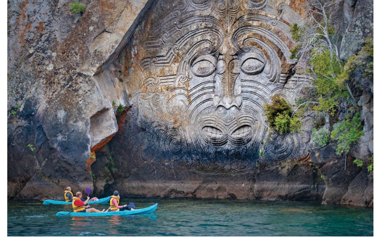
Rock carvings by master carver Matahi Brightwell at Mine Bay on Lake Taupō.