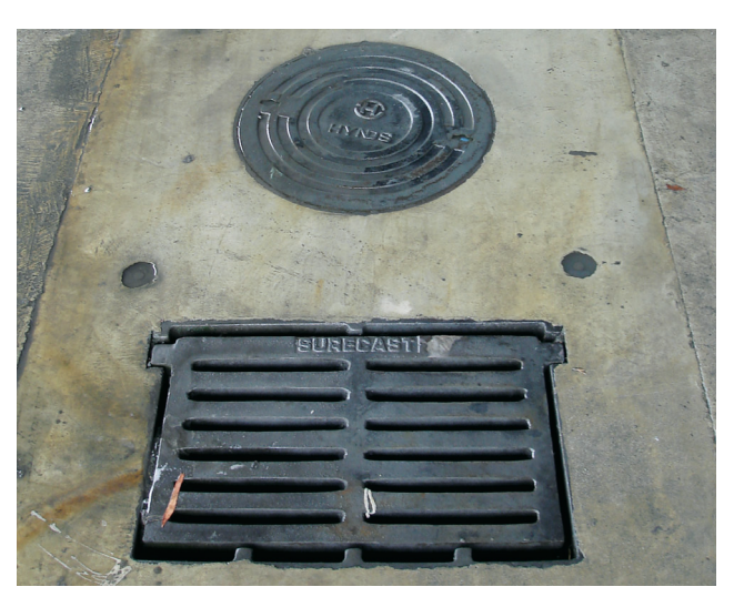
An oil/water separator for stormwater treatment