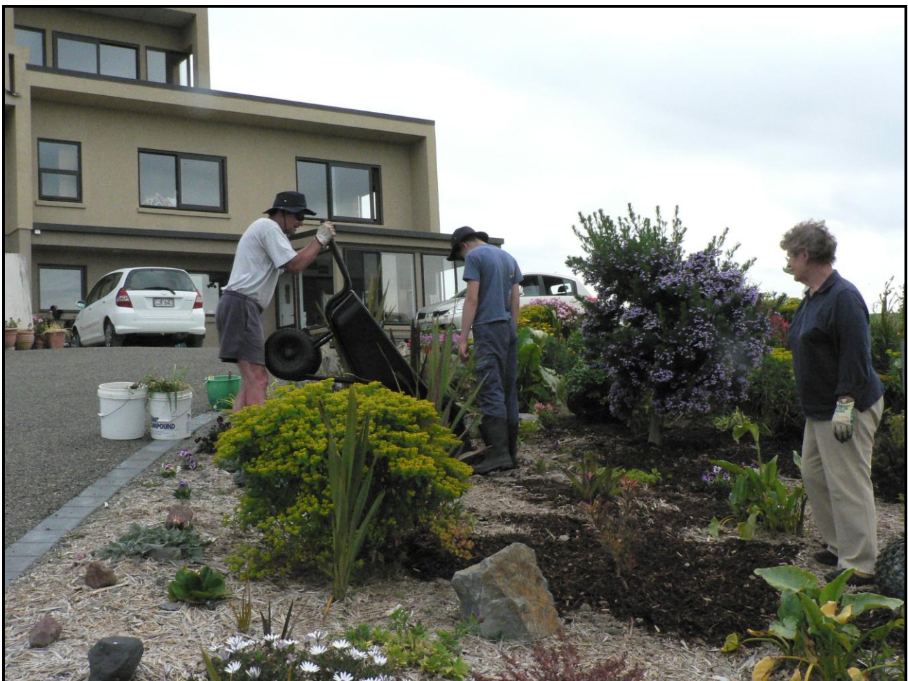
Working in my garden with my son and grandson on 23 November 2008.

We support the use of wind turbines, but how many do we need? We are keen gardeners and spend many hours outside. We value an unimpeded view of the landscape to Ruapehu in the north and west to the coast.