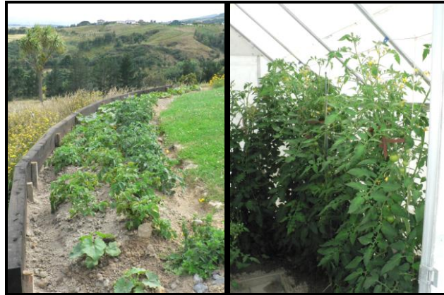
Growing potatoes, pumpkins and tomatoes in the vegetable garden and glass house.