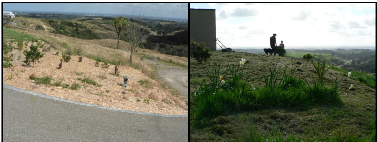
See the narrow, twisty Pahiatua-Aokautere Road in the distance to the right of the photo (and how much my garden has grown in a year compared to November 2008)?