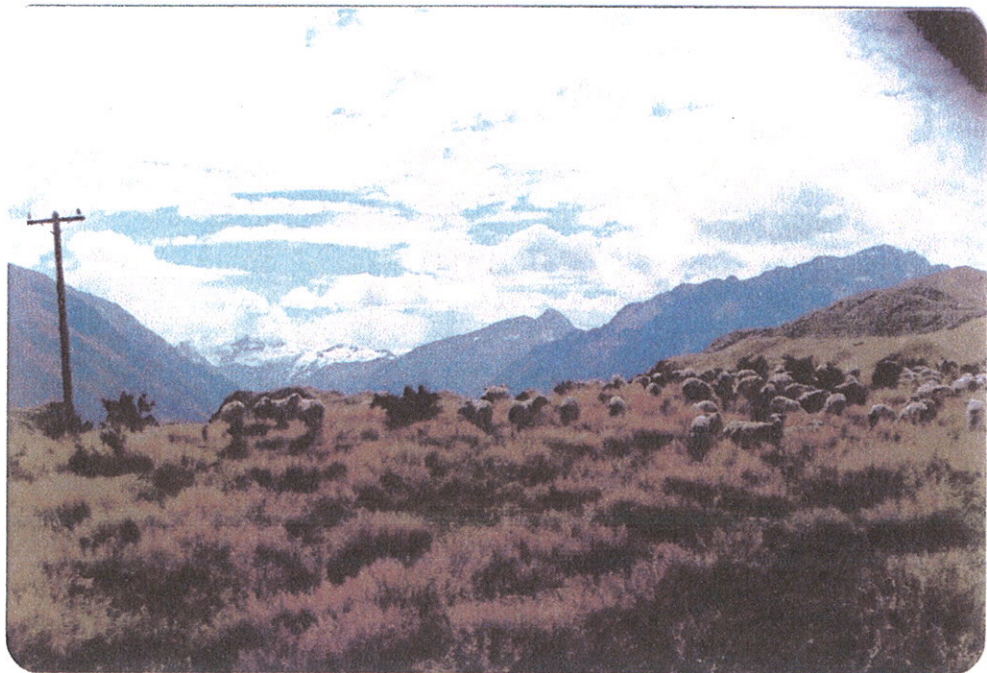
Area where I grew up (in mid-Castorbury)