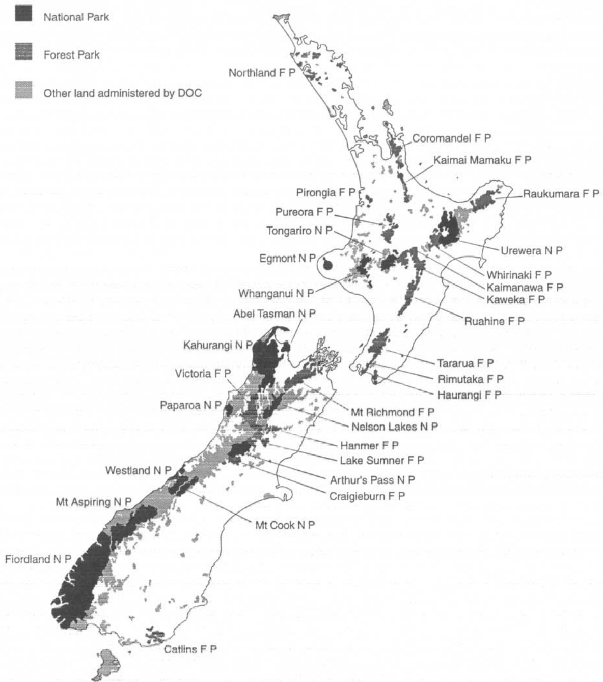
Figure 9.8 Land administered by the Department of Conservation in 1996