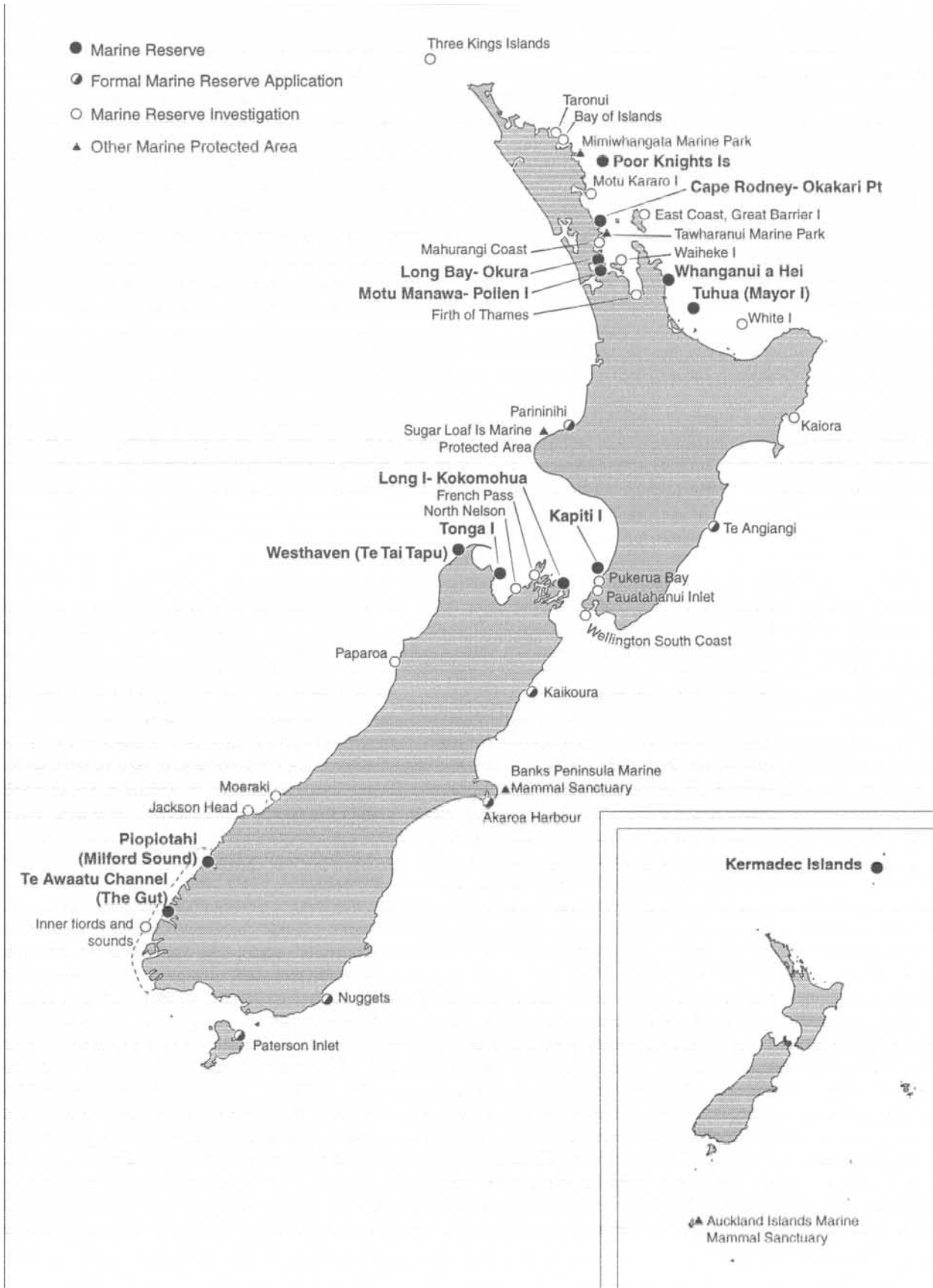
Figure 9.9 Marine reserves, proposals and investigations in 1996